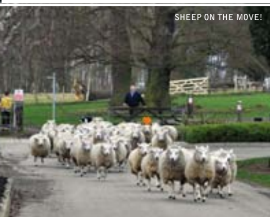
SHEEP ON THE MOVE!

equine specialist management and indoor and outdoor facilities, which will support the horses and their development. The site will also provide riders with the opportunity to engage with their own personal development by using facilities within the University of Lincoln's Human Performance Centre.