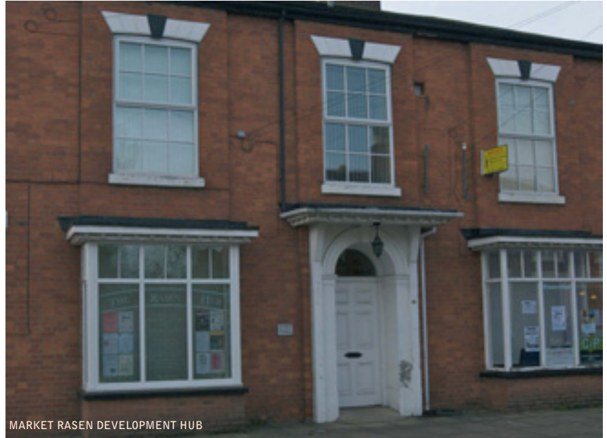
MARKET RASEN DEVELOPMENT HUB

Making laptops available for community use at Rasen Hub is next on the agenda for the MRDT.