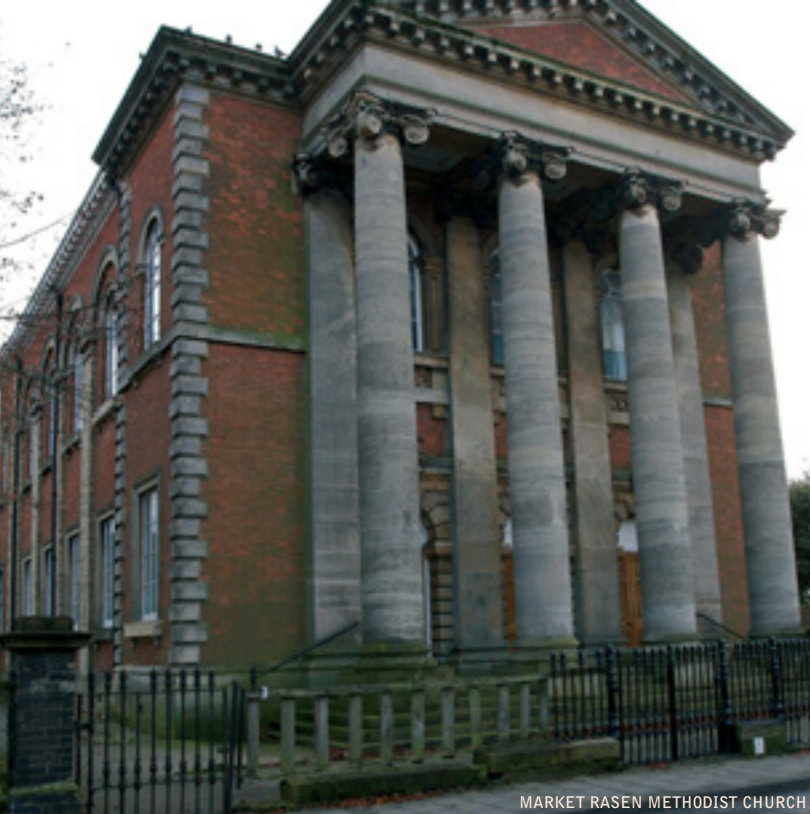
MARKET RASEN METHODIST CHURCH