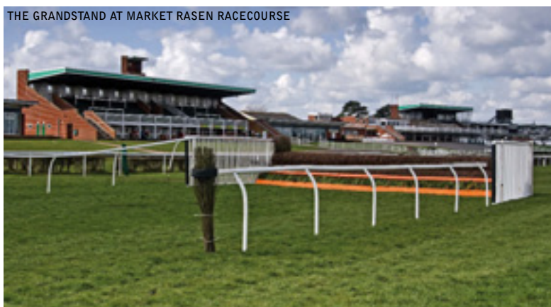
THE GRANDSTAND AT MARKET RASEN RACECOURSE

The next fair will be held on 30th and 31st May.