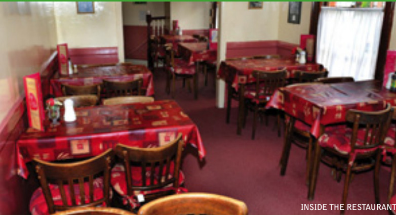
INSIDE THE RESTAURANT

Serving the community of Boston for over 100 years