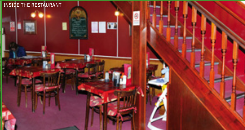
INSIDE THE RESTAURANT