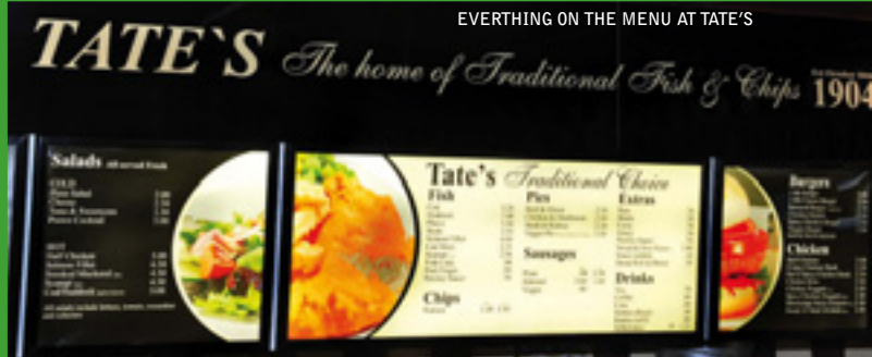
EVERYTHING ON THE MENU AT TATE'S

If you haven't tried Tate's you're certainly missing out on a treat. So why not drop-in for lunch, tea or your evening meal?