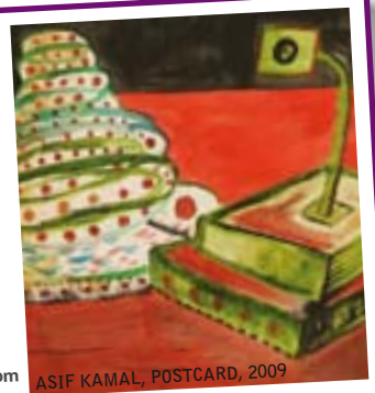
ASIF KAMAL, POSTCARD, 2009

Exhibition hours: Thurs-Sat 11am-4pm and by appointment