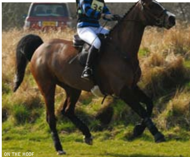
ON THE HOOF