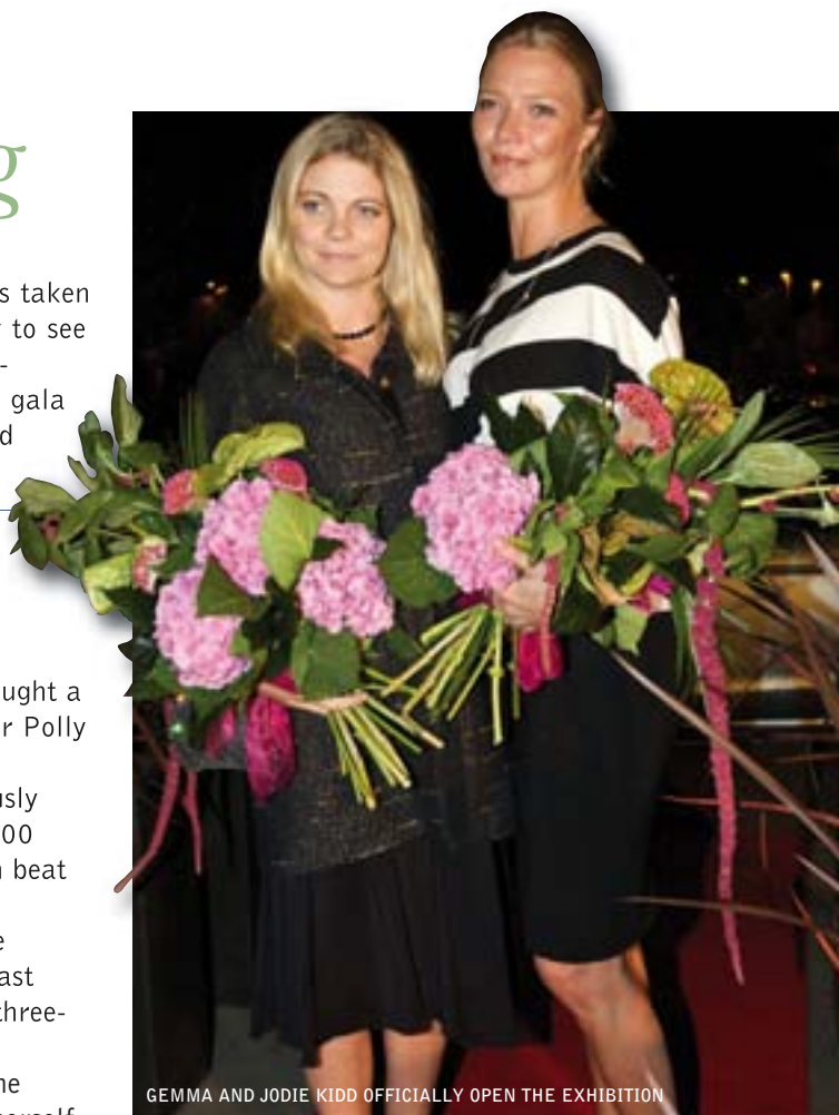
GEMMA AND JODIE KIDD OFFICIALLY OPEN THE EXHIBITION

Union Interiors in Grantham are hosting an exhibition on carefully selected photographs taken by Patrick Litchfield. This rare opportunity to see such legendary photography is running until mid-November and includes many iconic images. The gala opening saw the arrival of supermodels Jodie and Gemma Kidd.