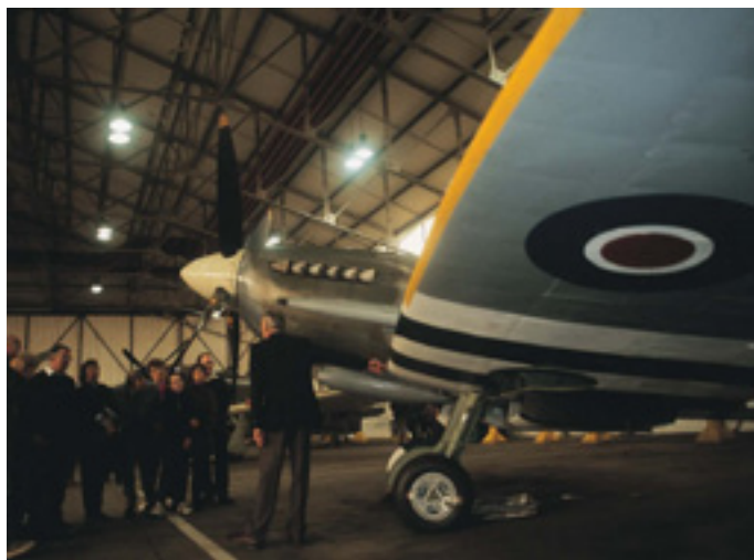
Visitors at the Battle of Britain Memorial Flight

A new education and activities centre has been opened at the Battle of Britain Memorial Flight based at RAF Coningsby.