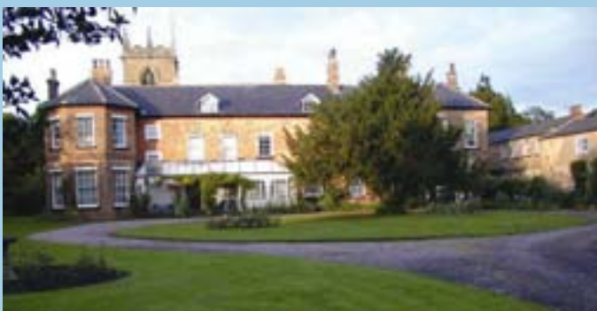
Willingham House at Willingham by Stow

The historic Grade II listed former rectory house with two cottages set in grounds of two acres, has been placed on the market by Humberts priced £880,000.