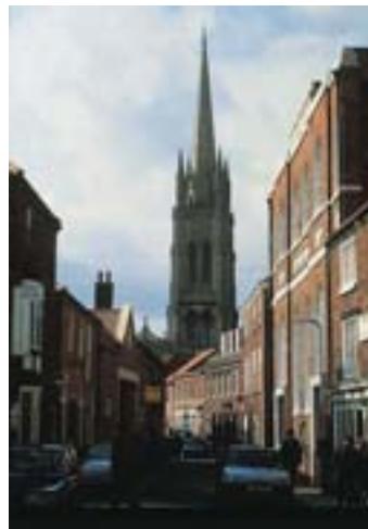
St James' Church, Louth – overall winner

Not all the entrants were from the Church of England. Epworth Wesley Memorial Methodist church was second in Medium sized parishes, repeating its success from earlier years.