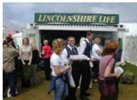
Lincoln College students serving Grantham gingerbread to visitors to the 'Lincolnshire Life' stand