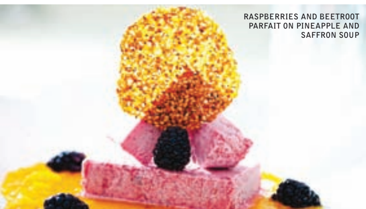
RASPBERRIES AND BEETROOT PARFAIT ON PINEAPPLE AND SAFFRON SOUP

Recipe courtesy of The Old Bakery, Lincoln