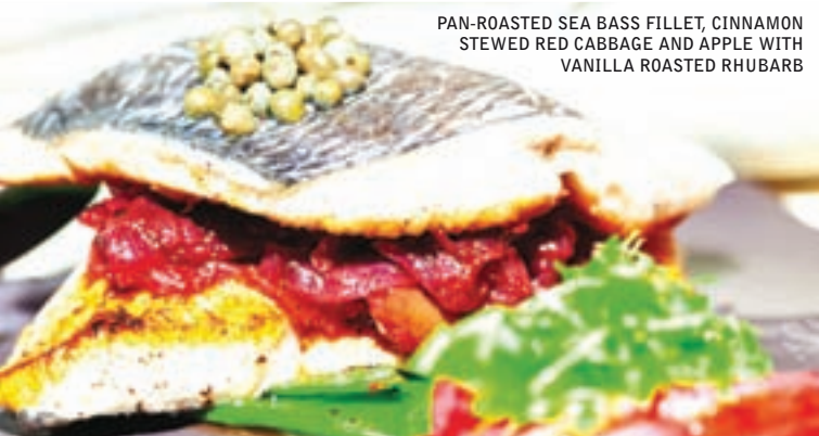
PAN-ROASTED SEA BASS FILLET, CINNAMON STEWED RED CABBAGE AND APPLE WITH VANILLA ROASTED RHUBARB