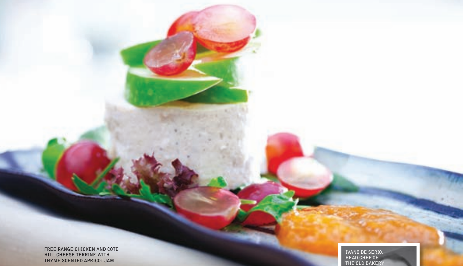
FREE RANGE CHICKEN AND COTE HILL CHEESE TERRINE WITH THYME SCENTED APRICOT JAM