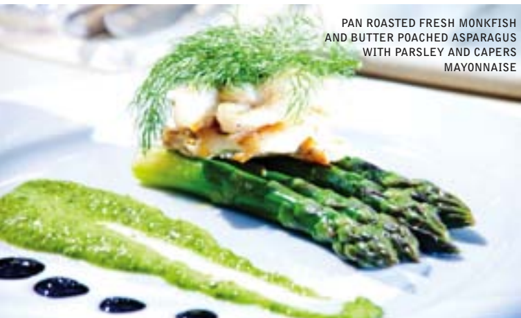
PAN ROASTED FRESH MONKFISH AND BUTTER POACHED ASPARAGUS WITH PARSLEY AND CAPERS MAYONNAISE

Recipe courtesy of The Old Bakery, Lincoln