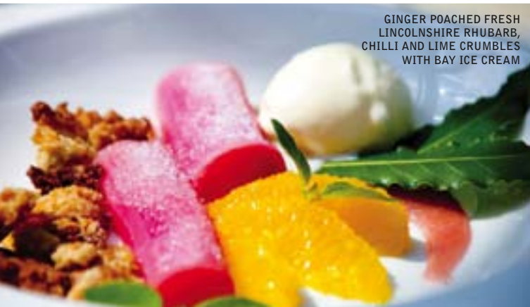
GINGER POACHED FRESH LINCOLNSHIRE RHUBARB, CHILLI AND LIME CRUMBLES WITH BAY ICE CREAM