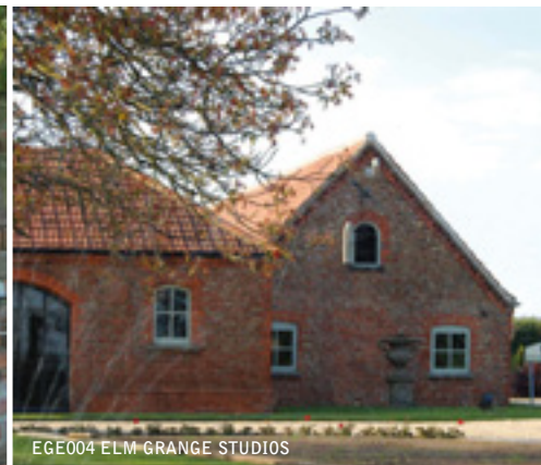
EGE004 ELM GRANGE STUDIOS