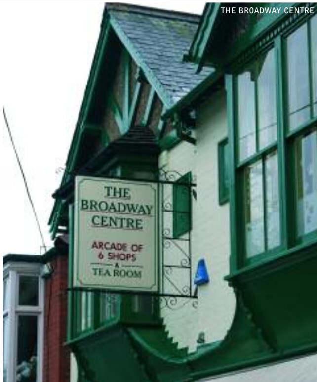
THE BROADWAY CENTRE