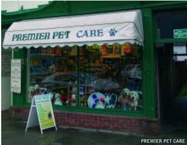
PREMIER PET CARE